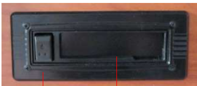
OPEN.F CASSEET DOOR