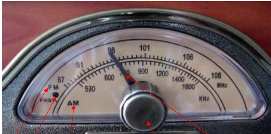
FM Frequency FM STEREO LED AM Frequency Tuning knob Frequency pointer